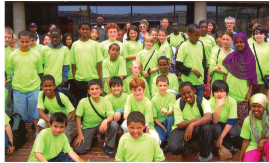
Fifth-graders from the Reiche School in Portland at the 2010 Southern Maine Children’s Water Festival.

tics, stormwater, low impact development, and behavior change are given once a month. Students design and then implement environmental projects in their communities. In TroutKids, students visit hatcheries and deliver eggs, maintain tanks, record data, and learn about fish anatomy and habitat. Drop in the Bucket programs are shorter or one-time presentations, workshops, and events at schools. Over the span of the 2009-2010 school year, PWD educators reached more than 4,500 students through more than 22,319 contact hours.