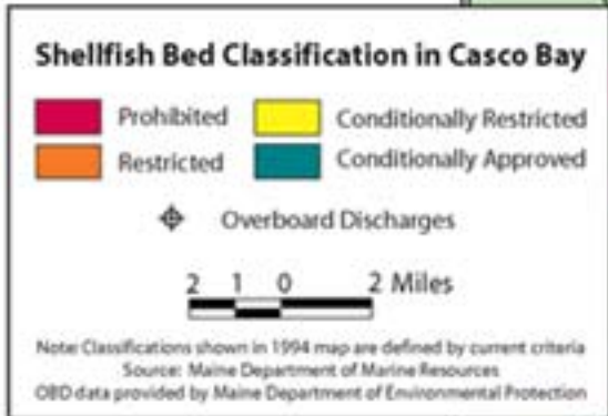
The acreage where shellfishing is prohibited or restricted in Casco Bay has declined dramatically in the last decade.